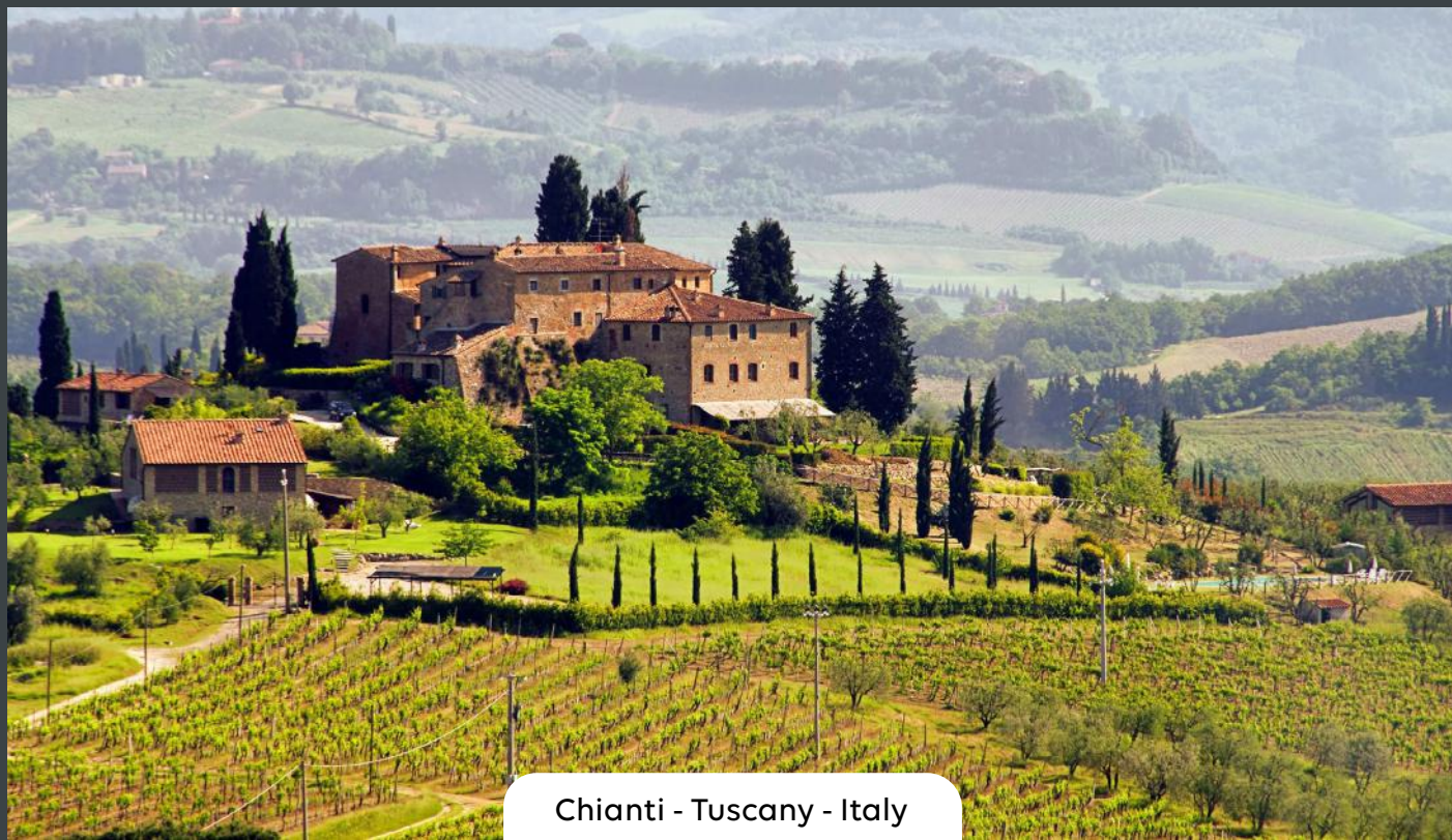
Chianti - Tuscany - Italy