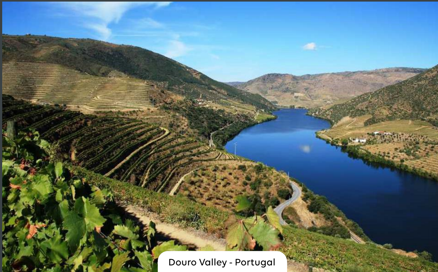
Douro Valley - Portugal