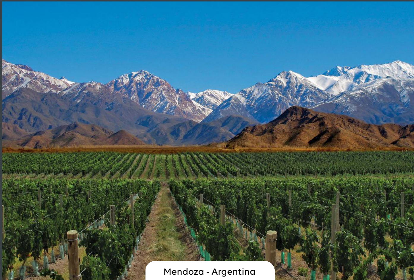
Mendoza - Argentina