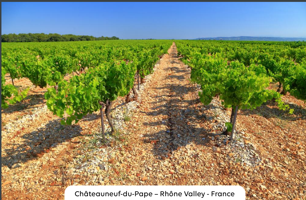
Châteauneuf-du-Pape - Rhône Valley - France