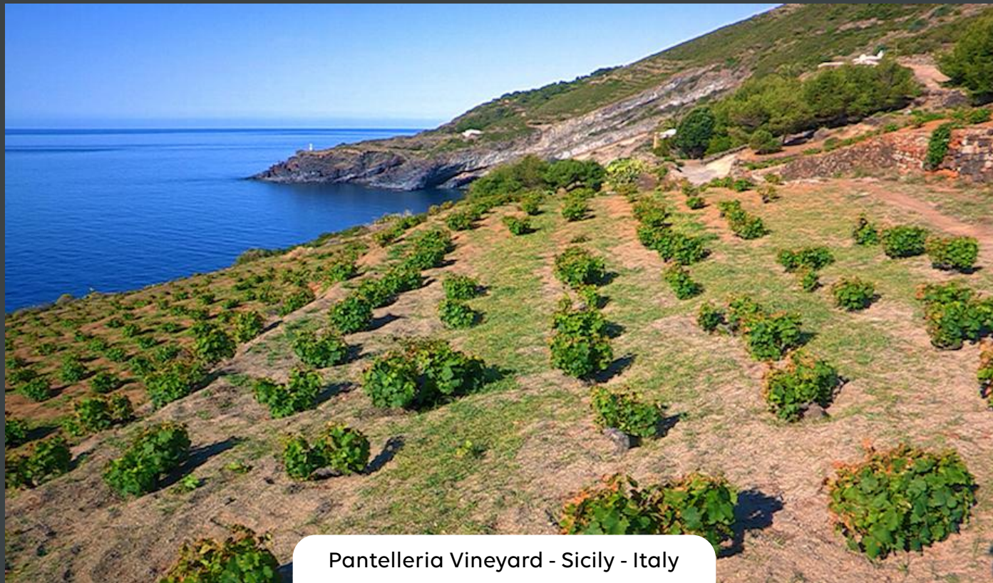
Pantelleria Vineyard - Sicily - Italy