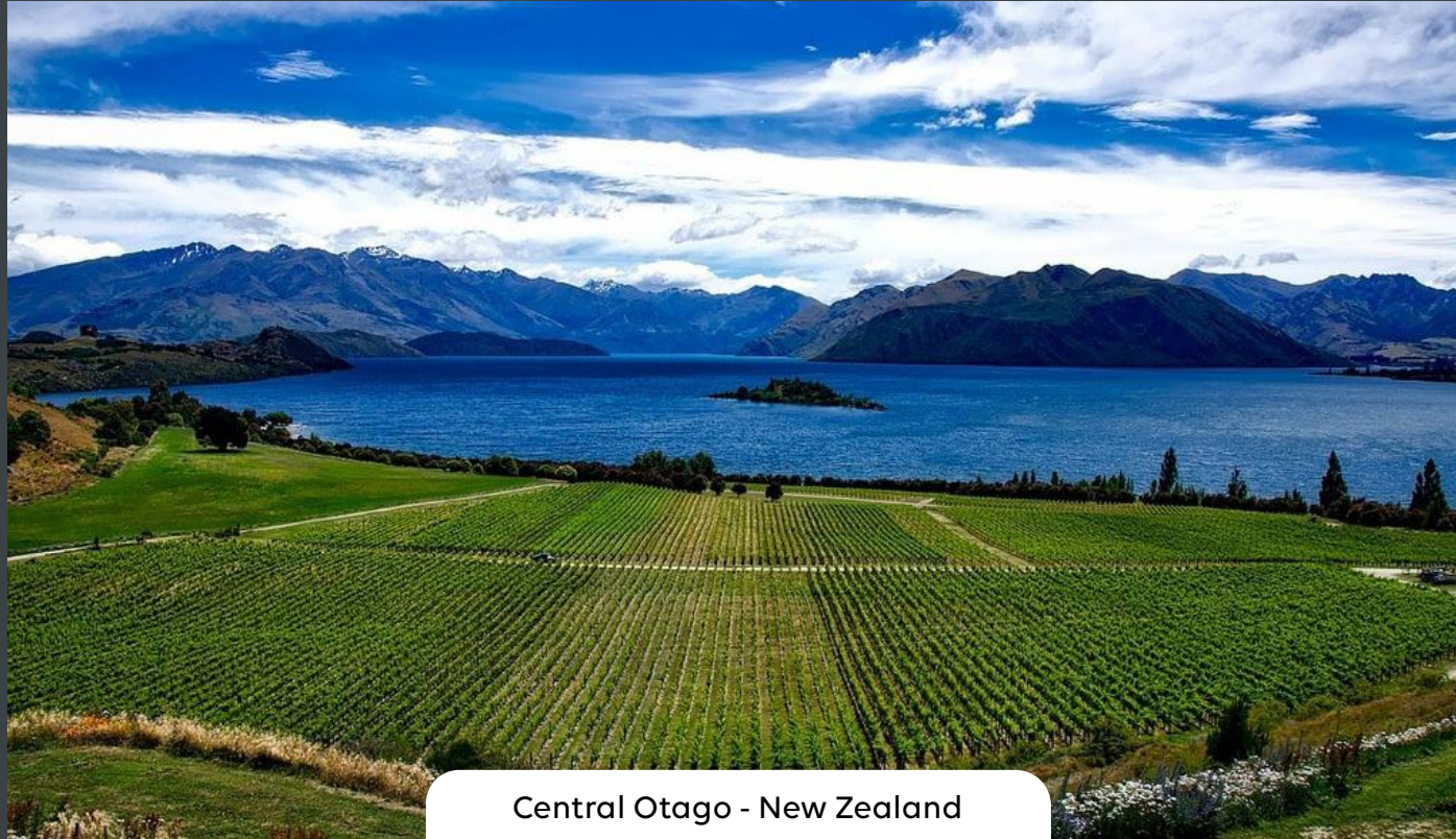
Central Otago - New Zealand