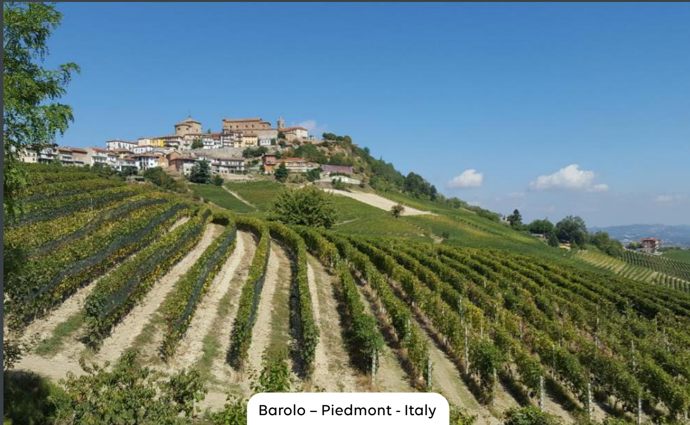
Barolo – Piedmont - Italy