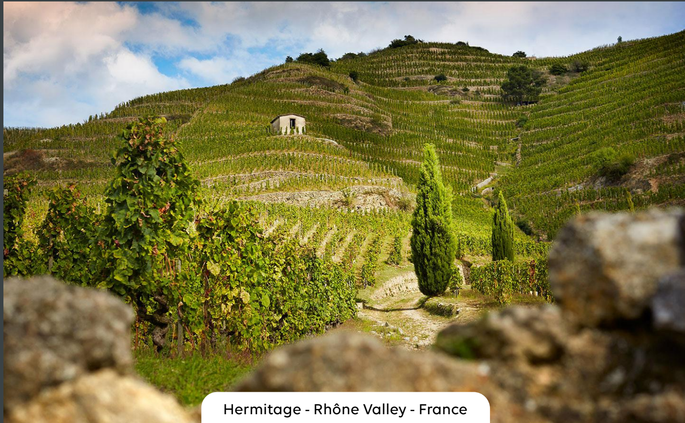
Hermitage - Rhône Valley - France