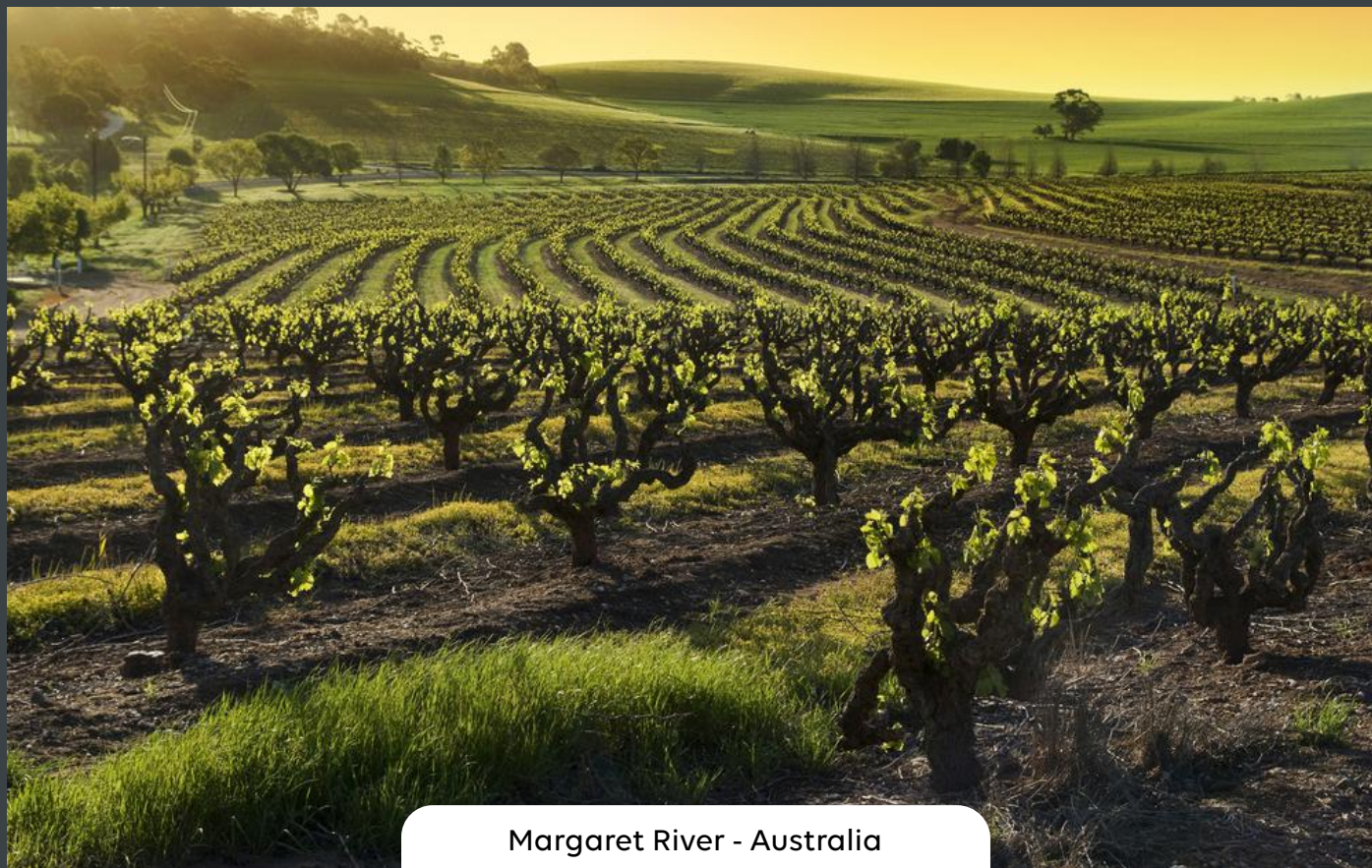
Margaret River - Australia