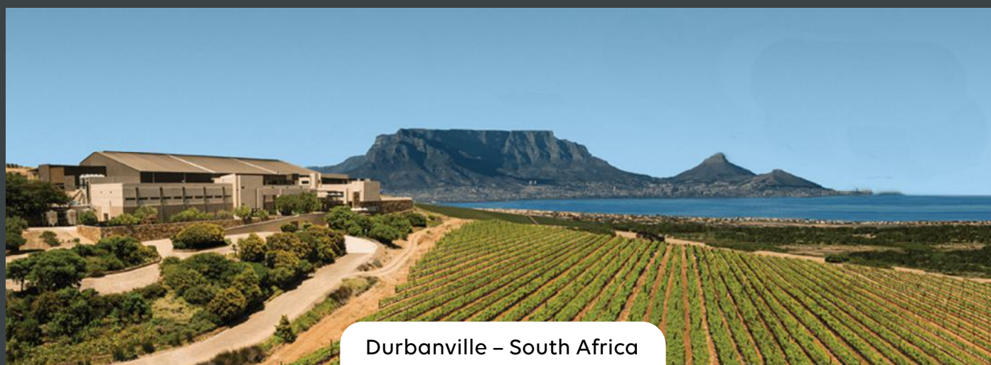
Durbanville - South Africa