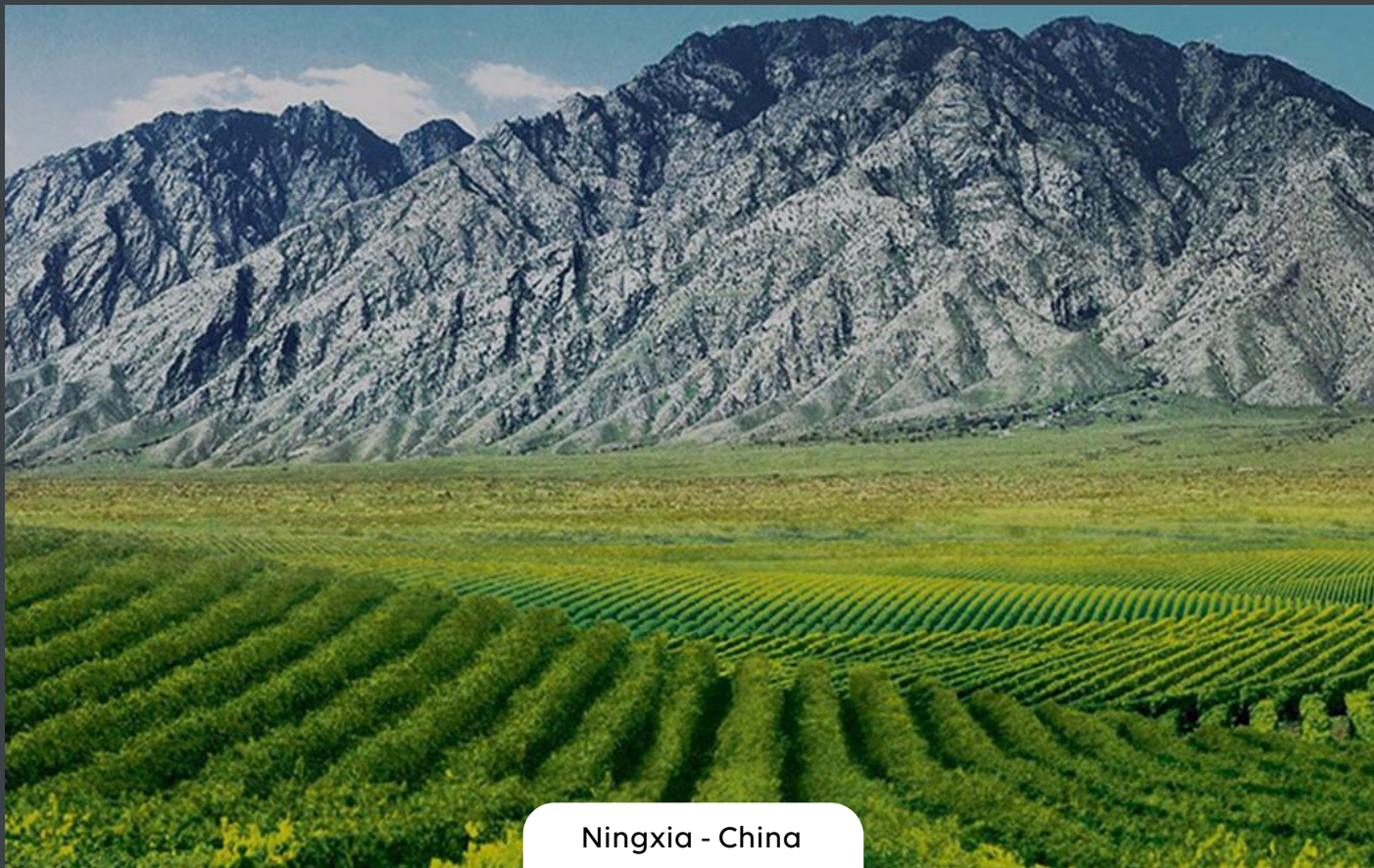
Ningxia - China