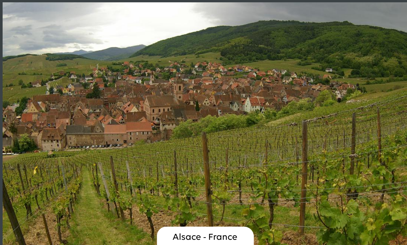
Alsace - France