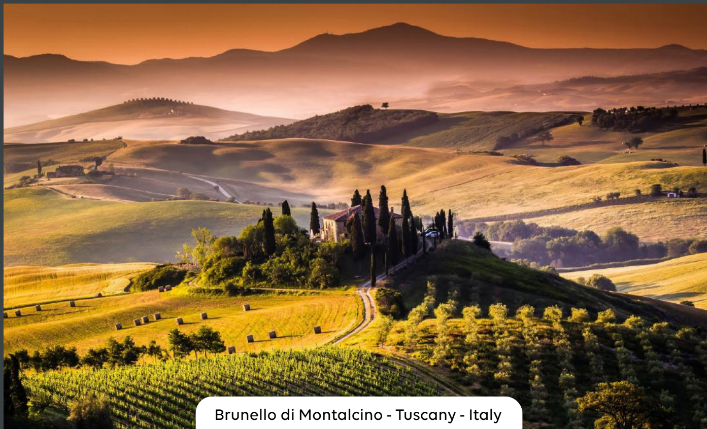
Brunello di Montalcino - Tuscany - Italy