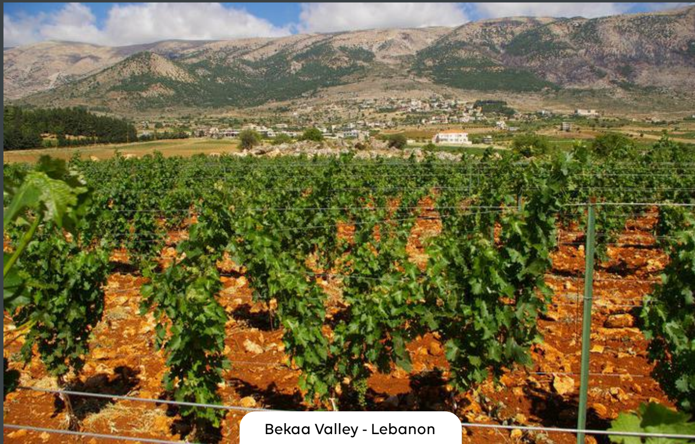
Bekaa Valley - Lebanon